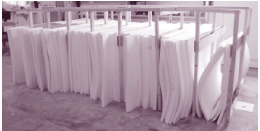
Sheet sizes: 37" x 82" x 1/2" or 1"

Limited quantities available while supplies last at the discounted rate of $1/lb*. Some discount material has been discolored by UV light. This slight cosmetic flaw may be hidden with a simple fabric cover, waterproof coating or paint. Samples available upon request. To place an order, call (828) 683-3523 or visit our web site: