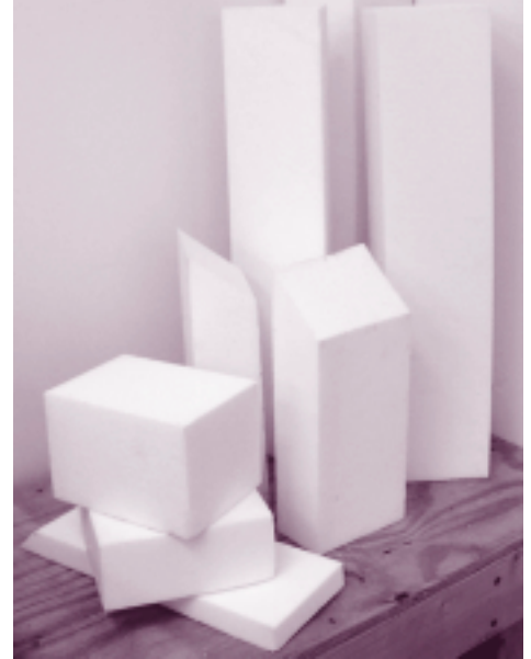
Some of the smaller, miscellaneous sizes available